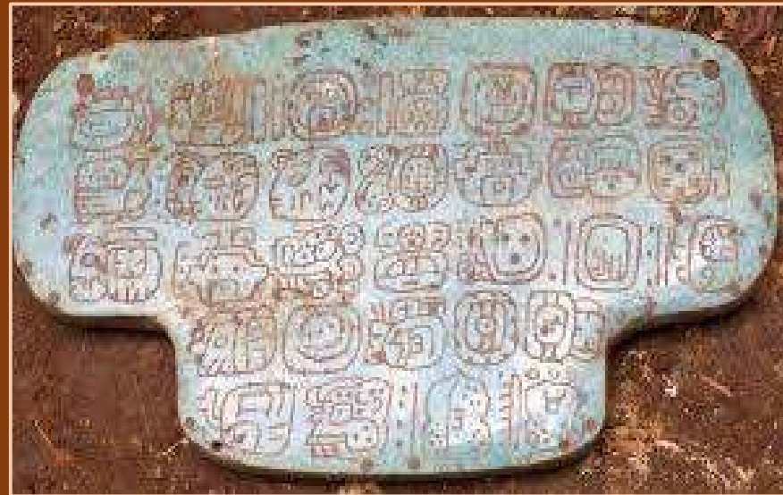
This stone was found in Belize and is similar to the one found at Blue Creek

This is highly probable due to the fact that there never has been a complete demise of the Maya nation, only Nephites.