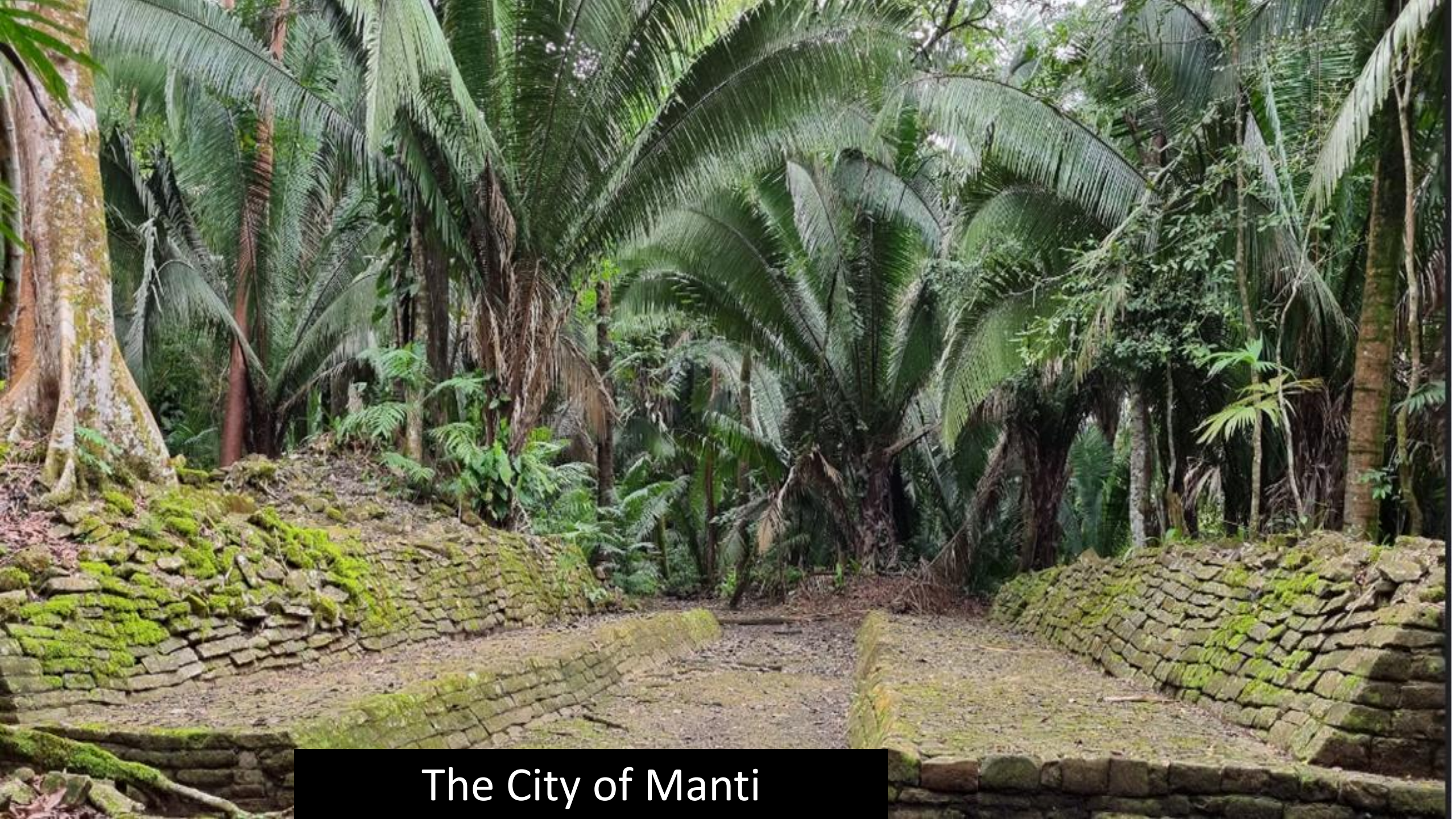
The City of Manti